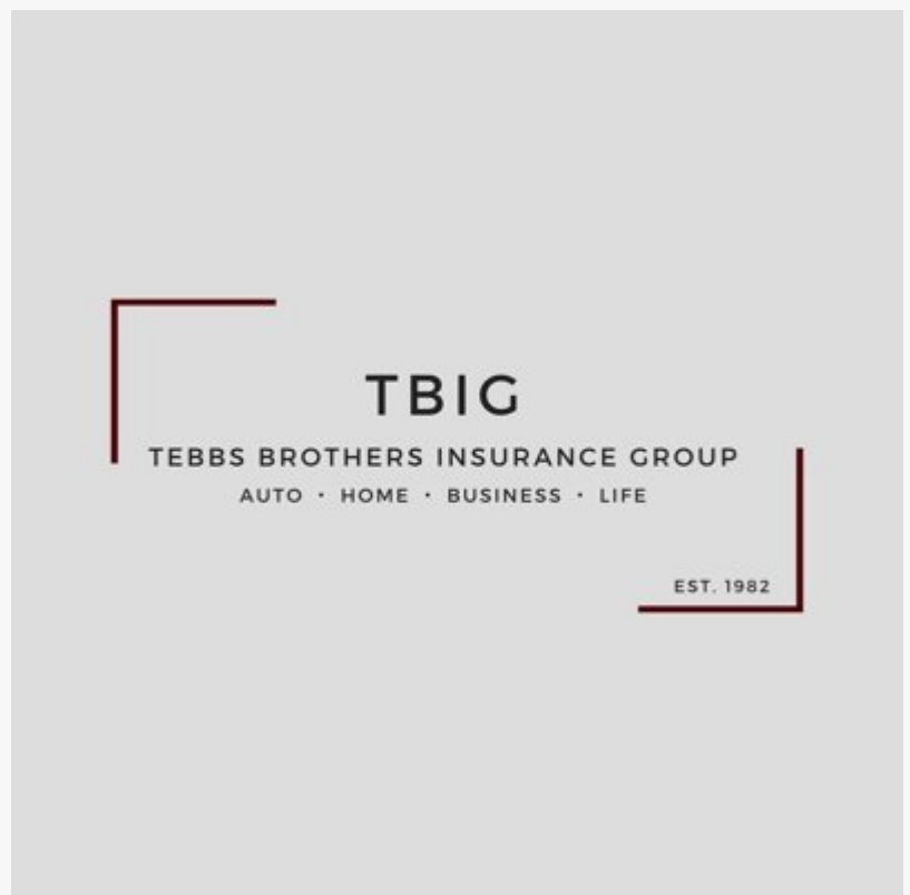
'Best of State' Insurance Murray UTAH: Top AUTO Life