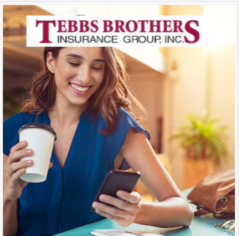
TEBBS Bros: UTAH's #1 BUSINESS Home Life Auto INS

Although physically located in Holladay, TBIG proudly offers their professional, family-based insurance services to residents of: Millcreek, Cottonwood, Draper, Murray, Midvale, Sandy, Woodridge Terrace, South Jordan, Sugarhouse,