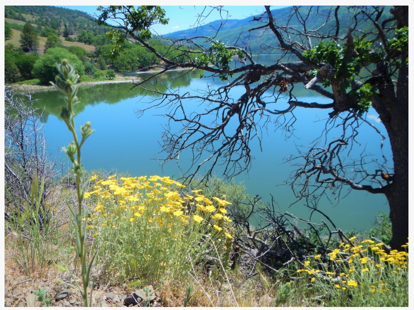
'Beneficial Use': Copco Lake: One of three lakes behind the Klamath Dams that together hold 45.4billion gallons of fresh water, providing domestic water, recreation and wildlife habitat

Clearly, the growing needs for domestic water to support human needs and food production as well as wildlife habitats must not be ignored. That said, dam removal proponents are short-sighted and are merely looking to their own needs, which do not consider the big picture.