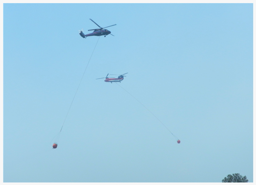
Helicopters shuttling water from Iron Gate Lake (behind the dam) to fight the Klamathon Wildfire, one of several wildfires that have threatened the priceless Cascade-Siskiyou National Monument.

species. Just a few of such species of fauna include: Yellow legged frog, giant California garter snake, giant California salamander and the short-nosed sucker fish. There are numerous raptors, other birds and water fowl that depend on the open-water of Copco and Iron Gate Lakes as well as the shoreline ecosystem for access to prey and other sustenance. This includes Bald Eagles,