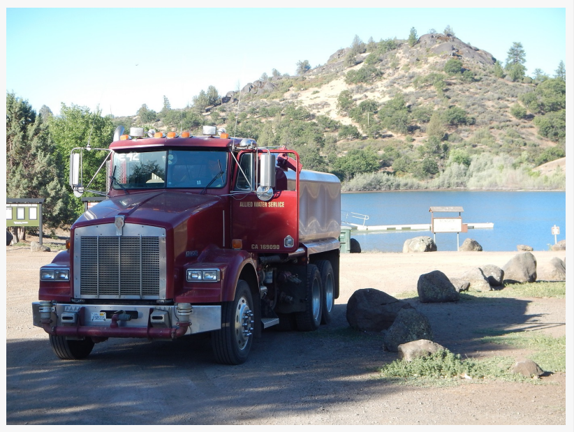
'Beneficial Use': CAL-FIRE drafted over one-million gallons of water from Iron Gate Lake battling the 38,000 acre Klamathon Fire. It was stopped before it incinerated the Cascade-Siskiyou National Monument and Ashland OR: Photo by; William E. Simpson II

"If the dams are removed, numerous threatened and endangered species of flora and fauna would lose critical habitat and would likely perish, collapsing the area's biodiversity and trophic cascades, further speeding the potential extinction of even more rare