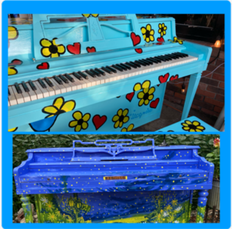
Two of the four community pianos on Amboy Avenue in Edison NJ, as donated by residents and painted by local artists.