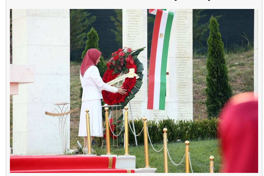
Iran, Celebrating The 40th Anniversary Of The Start Of The Nationwide Resistance Ashraf 3.

which they called on the international community to put an end to all dealings with, and appearsement of a regime whose president is one of the worst criminals against humanity in modern times.