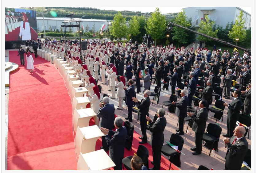
Iran - Celebrating The 40th Anniversary Of The Start Of The Nationwide Resistance Ashraf 3.