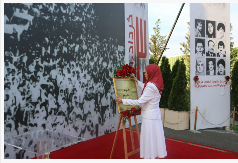
Iran - Celebrating The 40th Anniversary Of The Start Of The Nationwide Resistance - Maryam Rajavi.

On Sunday, supporters of the MEK and the Iranian Resistance held rallies in major European capitals and cities, including London, Cologne, Vienna, Oslo, Geneva, and elsewhere, during