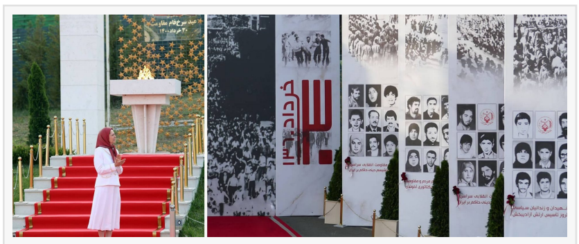
The demonstration of 500,000 people in Tehran, and the Day of Martyrs and Political Prisoners.

Mrs. Rajavi added that emerging out of this disgraceful election the religious dictatorship will be more vulnerable and fragile. It is bound to perpetrate worse crimes with the henchman of the 1988 massacre at its helm. Raisi