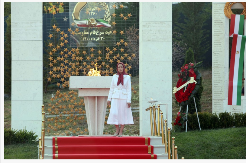
Celebrating The 40th Anniversary Of The Start Of The Nationwide Resistance - Maryam Rajavi.

Only someone can become the regime president who is immersed in the blood of the massacred MEK members and supporters. Therefore, Khamenei accepted both the scandal of appointing this person and the disgrace of a boycotted election. By their nationwide boycott of the sham