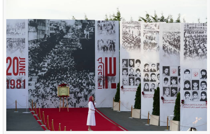
4 - Celebrating The 40th Anniversary Of The Start Of The Nationwide Resistance - Ashraf 3

must be brought to justice in the international court of justice.