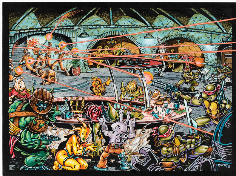
Teenage Mutant Ninja Turtles #5 October 1985 comic book cover original final color art by co-creator Kevin Eastman. Action-packed full-color scene featuring all four Turtles, Professor Honeycutt/Fugitoid. Size: 10 5/8 x 14 1/4 in. Estimate $35,000-$50,000

The comic book section features more than its fair share of coveted titles. X-Men #1, from September 1963, graded CGC 5.0 VG/Fine, introduces the X-Men (Professor X, Cyclops, Iceman, Angel, Beast and Marvel Girl) and Magneto. This important Silver Age Marvel comic could reach $20,000-$35,000. Another great #1 issue, the 1984 debut of