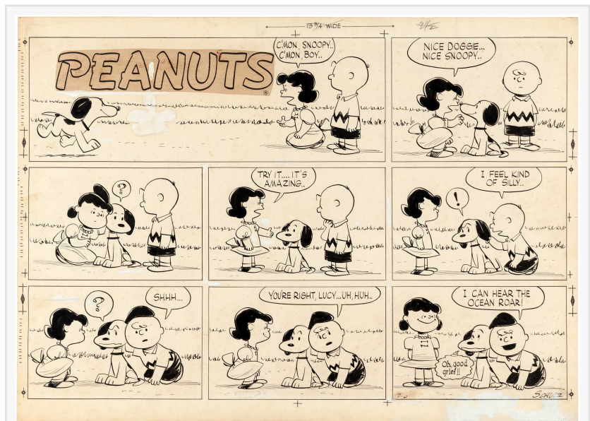
Peanuts July 3, 1955 Sunday page original art by Charles Schulz. Features Charlie Brown, Lucy and Snoopy. Fine condition overall. Estimate $75,000-$100,000

Nothing is hotter in today's auction marketplace than vintage Pokemon cards, especially in proof format. Hake's will make history on June 30 when it presents the earliest uncut Pokemon proof sheet ever to cross the auction block. From 1999, the shadowless, holographic sheet contains 99 cards, including seven ultra-rare Charizard cards. The property of a Hasbro employee who received it as a gift in 1999, it could reach record territory on auction day. Estimate: $100,000-$200,000.