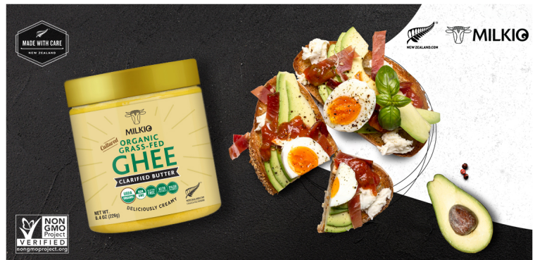
cultured organic Ghee from Milkio Foods

Milkio grass fed ghee products are lactose, casein, gluten, carb, and sugar-free dairy with high smoke points and long shelf-stability.