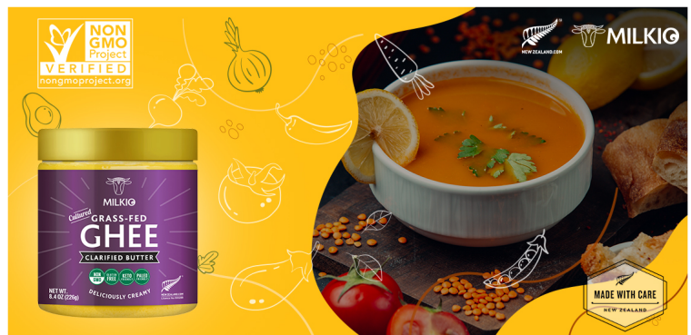
cultured Grass-fed ghee