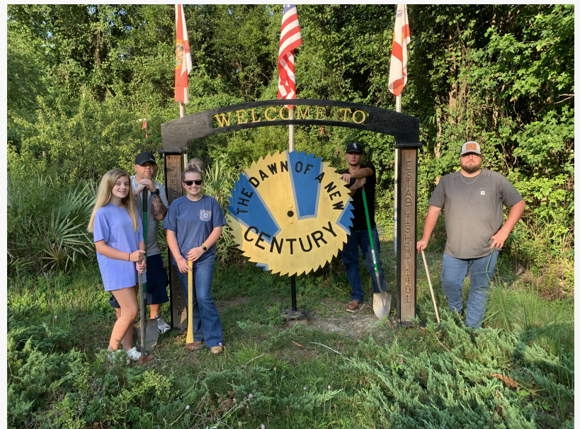
Some of the treasure hunters looking for Crow Cash in Century, Florida

Crow never wrote down the locations of the many tubular vaults, and during his incarceration