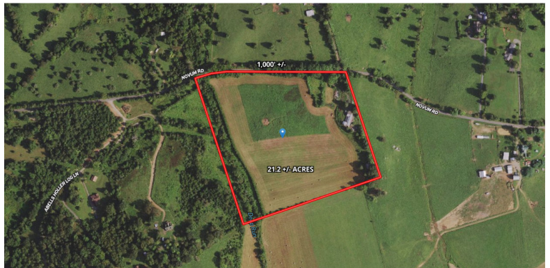
2012 Novum Rd., Reva, VA 22735