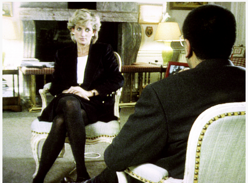
Diana: The Interview That Shocked The World, streaming on iwonder