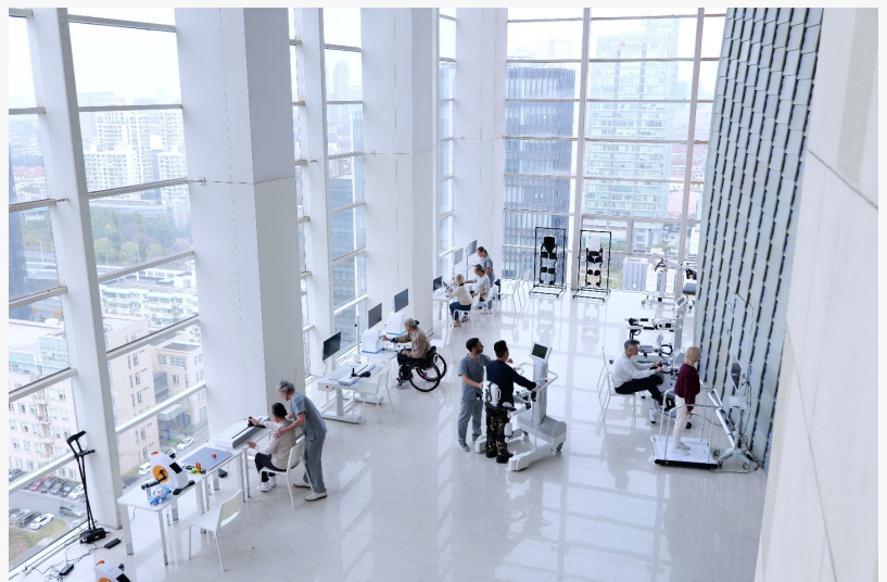
Fourier Intelligence's RehabHub™