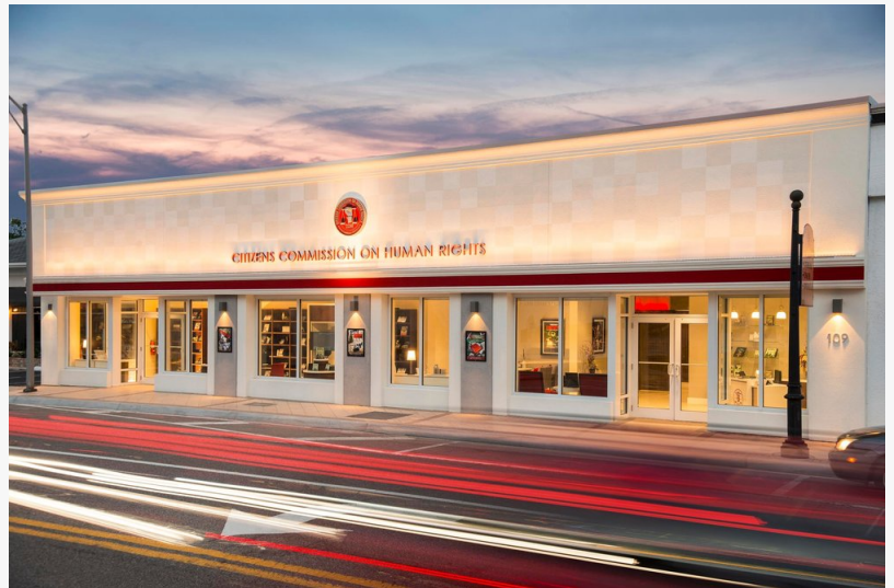
The headquarters for CCHR Florida are located in downtown Clearwater.

/EINPresswire.com/ -- During the 2021 legislative session, Florida lawmakers passed a bill titled School Safety which changes how the Baker Act , an involuntary psychiatric examination, is applied to a minor student. This change and several others, which are slated to go into effect on July 1st, aim to reduce the number of children subjected to the trauma of a Baker Act each year.