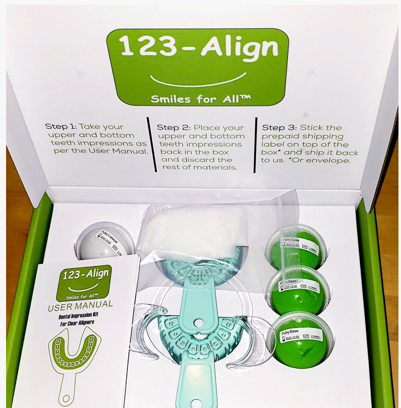
As easy as 1-2-3