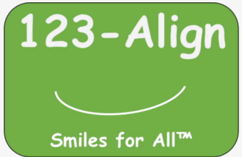
Smiles for All

FORT MILL, SC, UNITED STATES, June 22, 2021 /EINPresswire.com/ -- Are you hiding your smile behind a mask? U Smile Dental, LLC ("123-Align" or the "Company"), an FDA registered and HIPAA compliant dental aligner company, today announced the launch of "Smiles for All": at-home clear aligners system at an affordable price.