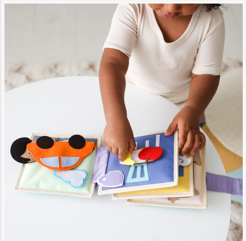
Children will engage in open ended imaginative play for hours with Educating AMY's busy books.

Says Educating AMY founder Holly Lear, "The first five years are so critical in terms of child development, but many homes are overrun with too many toys providing too many distractions and no real opportunities to learn or grow. Our busy books are based on the latest brain research and designed to help kids focus on specific activities, one at a time, building age-appropriate skills and, just as importantly, the self-confidence and resilience they need to become independent learners."