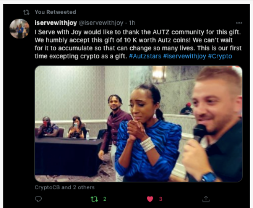
Successful AUTZ Token Launch Donation

Even after the 3% of all transactions are deducted and redistributed among all AUTZ holders, AUTZ continues to donate and give back even more to the ASD community. In addition to