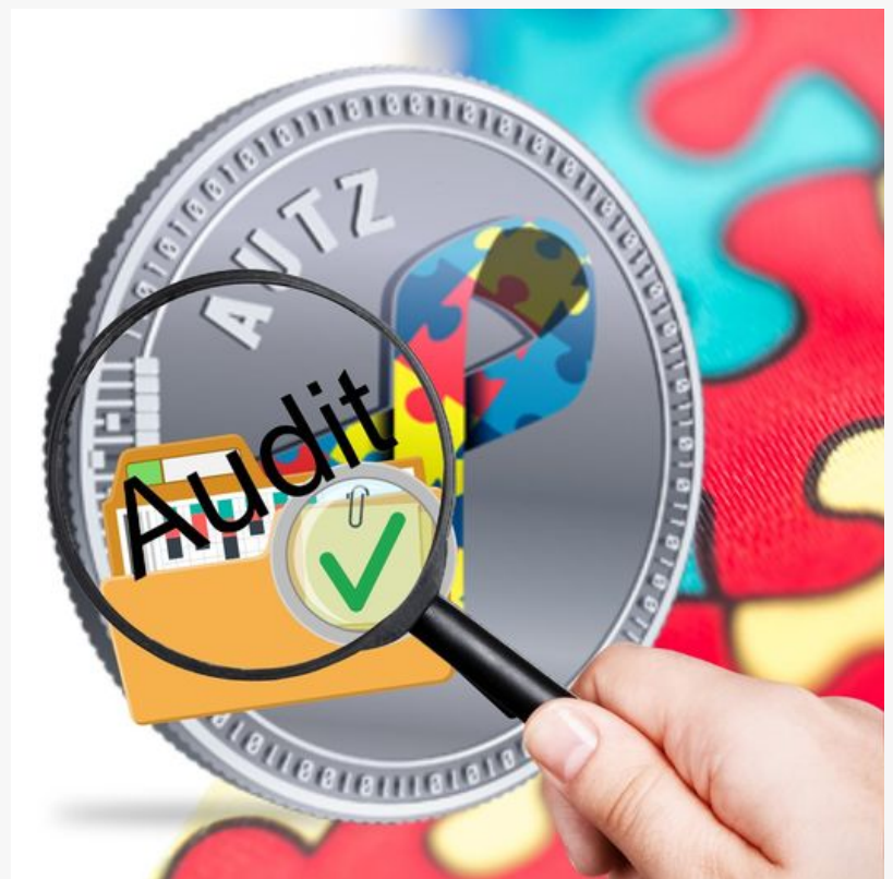
AUTZ Token Audit