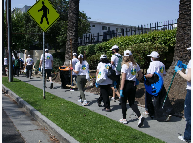
Some 50 volunteers took off from the Church of Scientology Celebrity Centre in Hollywood.