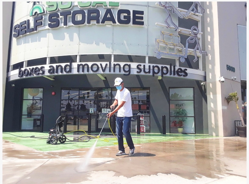
Volunteers power washed sections of Hollywood Boulevard during the Hollywood Village June Cleanup.