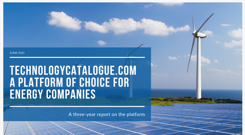
TechnologyCatalogue.com releases three-year report on the platform

“Activities of end-users on the platform mirror the trends in the energy sector as a whole. For instance, digitalisation and renewable energy being popular themes reflects the increasing indispensability of digitalisation as a business model and the inevitable journey towards clean energy sources, respectively,” the report said.