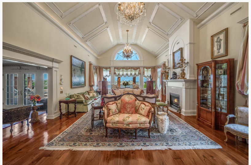
Half mile walk to beach; close proximity to top-tier schools

Additional features include a formal dining room and library/family room; six fireplaces throughout the home; a gourmet kitchen with a butcher block topped island, Mediterranean tile details, state-of-the-art appliances, granite countertops, and custom detailed cabinetry, all framing ocean and river views; an in-law suite accessible by separate entrance including a separate custom mahogany office/den and full ensuite bathroom; two second-floor bedrooms, each with ensuite bathrooms and walk-in closets;