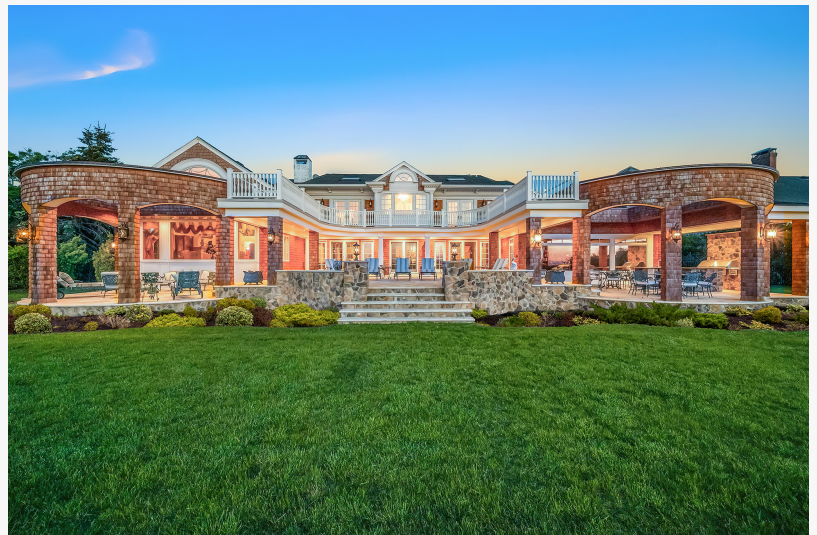
Spectacular landscaping and beautiful architecture