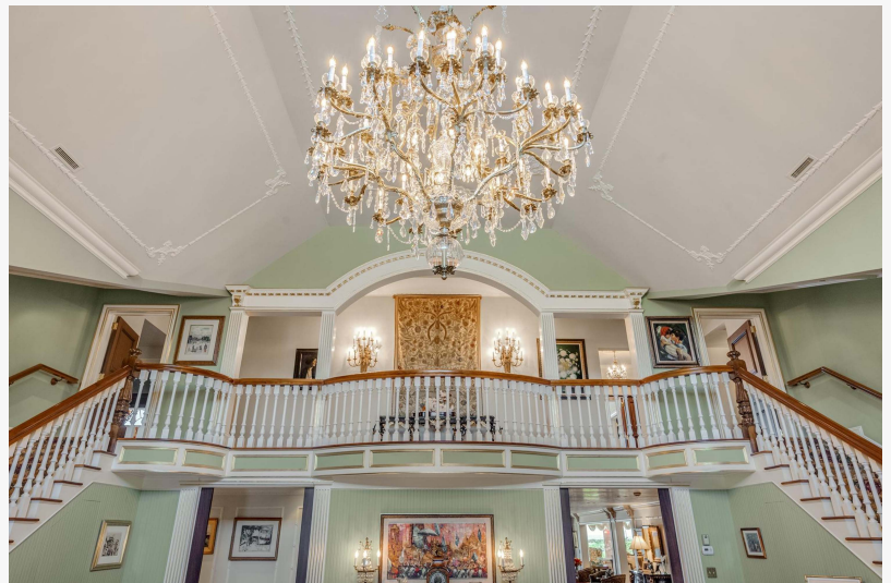
Prime location in Tri-State area, 39 minutes to NYC