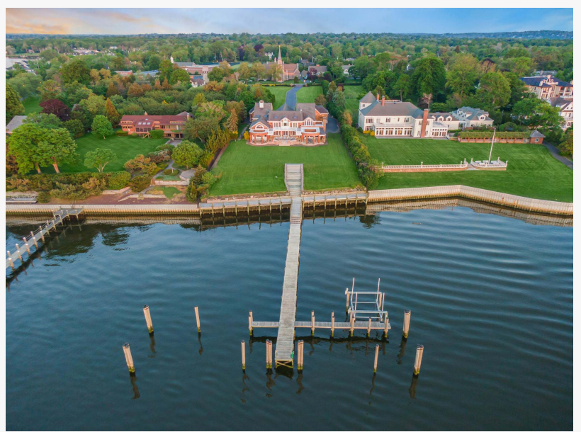
Waterfront yachting paradise; ocean views; deep water dock

two third-floor bedrooms with full closets and ensuite bathrooms; a lower-level lounge with crafted cherry wood, billiard parlor, bar, fully equipped 1,450sf gym, home theater and entertainment area; a mahogany paneled elevator accesses three levels; travertine outdoor entertainment areas with a newly installed summer kitchen, granite countertops, and Lynx appliances; two high-ceiling garages that can accommodate 5 cars and car lifts to double capacity; an additional 2-car garage attached to main home; and a 220-volt high speed charging station for electric cars—all just 7 minutes to Monmouth Beach and within close proximity to New York City and numerous airports.