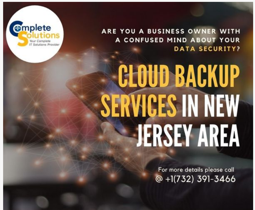
Cloud Backup Service