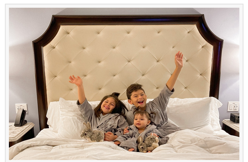
This summer turn your vacation into a playcation at The Houstonian Hotel, Club & Spa.

There is something for everyone on The Houstonian's luxurious, 27-acre playground in the middle of the city with an in-room movie, gifts for the