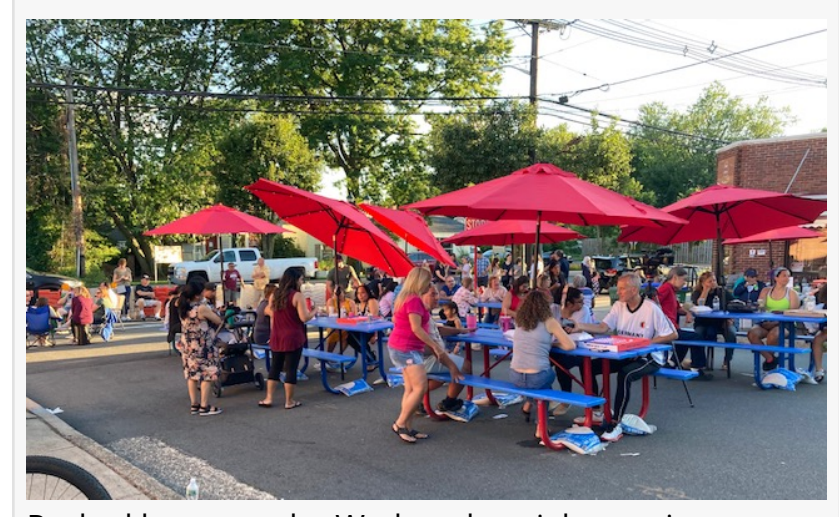
Packed house at the Wednesday night music event on Amboy Avenue, June 23, 2021.