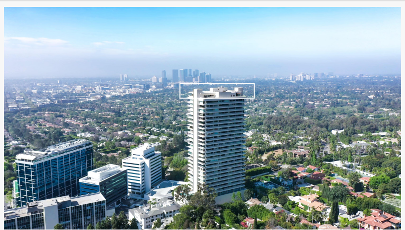
Sierra Towers Penthouse, 9255 Doheny Road #PH1 & 2, West Hollywood, CA

“This property is truly unmatched in L.A. It’s a full floor double penthouse and also a rare blank slate to create a fully bespoke, iconic California lifestyle. The highest-end products are sold at auction every day, and now with Concierge Auctions, one savvy buyer will have the opportunity of a lifetime within one of the most sought-after addresses in this city,” Metropoulos said.