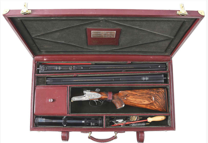
Cased Franz Sodja sidelock .375 H&H and .458 Win Mag safari-grade double-barrel rifle built in Ferlach, Austria. Engraved with African game scenes. Estimate $20,000-$25,000