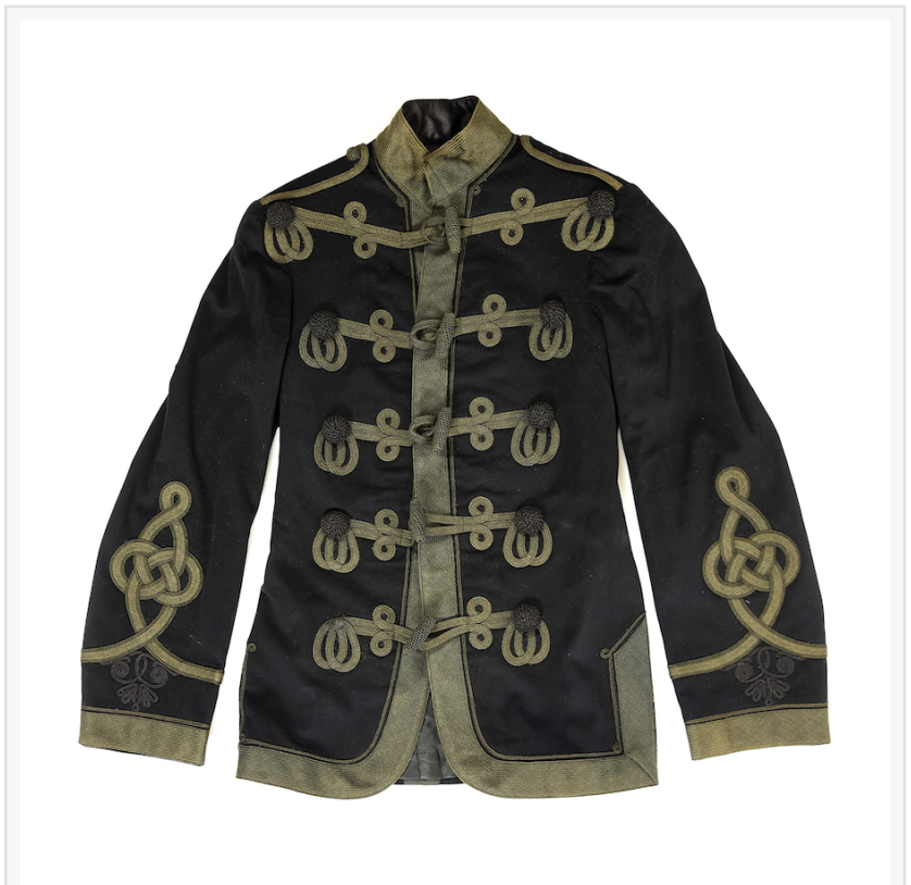
US Marine Corps Pattern 1904 officer's jacket with mohair-braid trim. Very good condition. Estimate $1,000-$2,000

Day 3 features a wealth of swords and sabers; military uniforms and apparel; field gear,