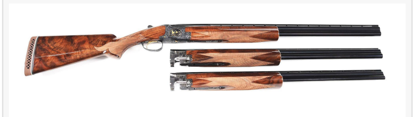
Circa-1968 Browning (Belgium) Midas-grade superposed over/under shotgun with 3-barrel (.20, .28, .410 gauge) set and factory letter. Estimate $15,000-$20,000