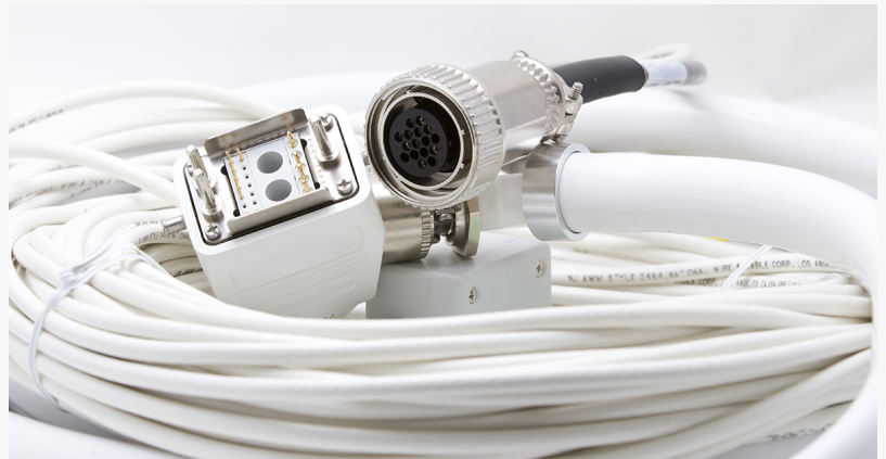
Segue Manufacturing - Molded Medical Cable Expertise