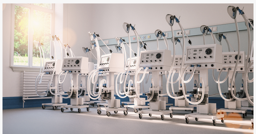
Segue Manufacturing - Medical Device Expertise