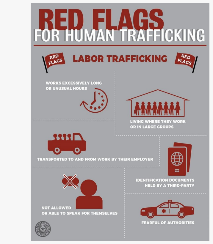
Red Flags For Human Trafficking

Clergy, Boy Scouts, and any other forms of industrial sexual abuse have been exposed and victims and survivors started receiving compensation, but human trafficking victims are not as fortunate. In 2019,