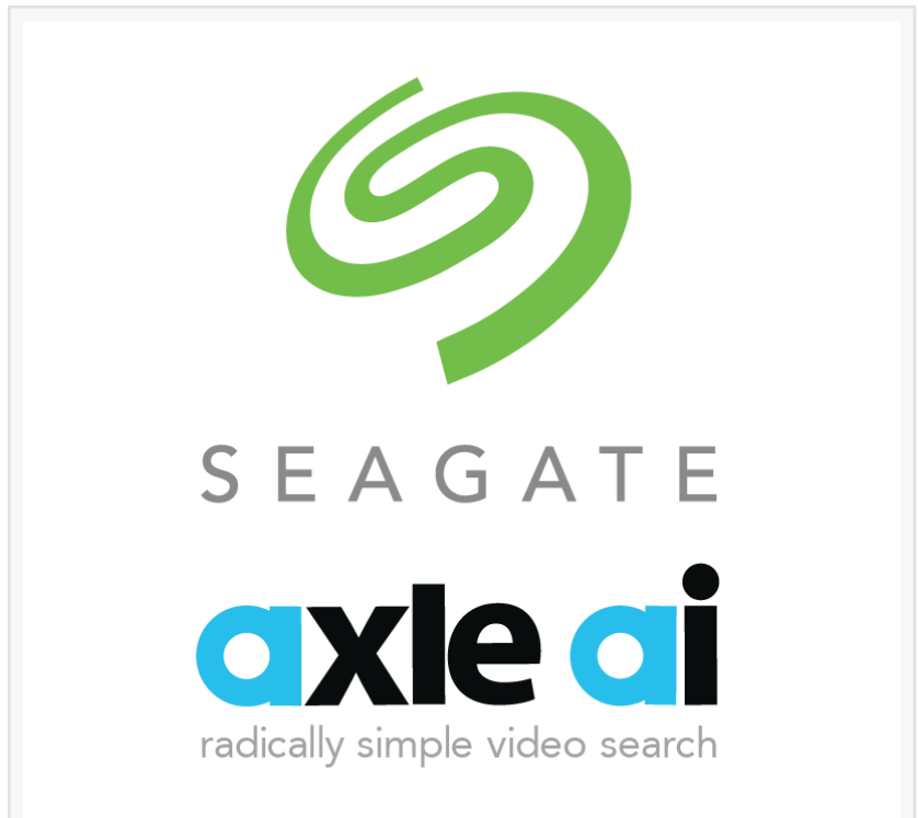
Seagate and axle ai logos

The new collaboration is centered around the Seagate® Lyve™ edge-to-cloud mass storage platform, designed to offer a coherent data storage architecture extending from on-premise removable media through industry-leading cloud storage-as-a-service (STaaS), all from a single trusted vendor. Axle ai's software is a browser-based front end that can be used across multiple storage devices and