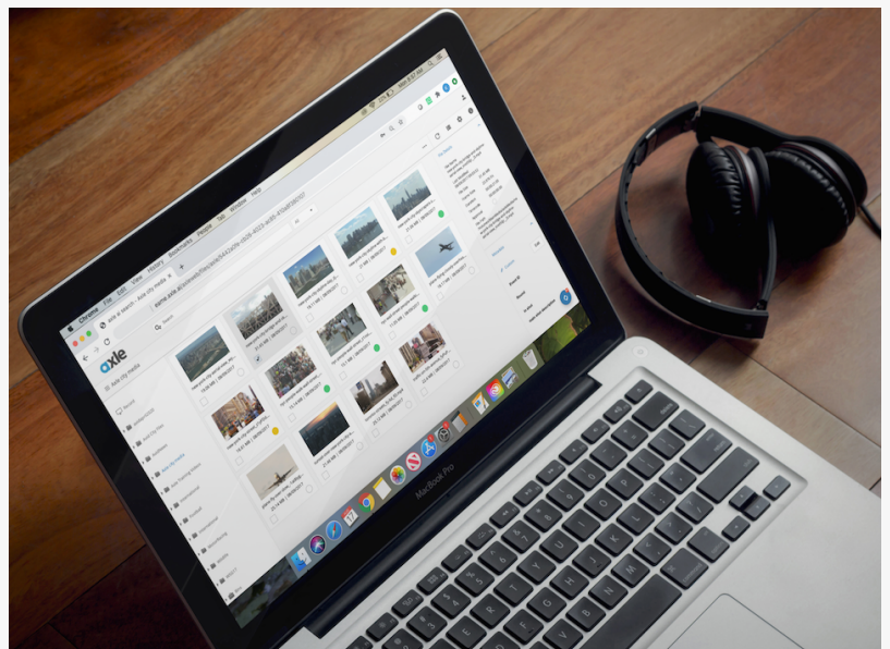
axle ai's radically simple browser interface on a laptop