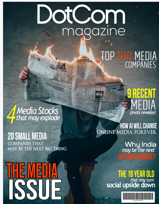
The DotCom Magazine Exclusive Entrepreneur Spotlight Series