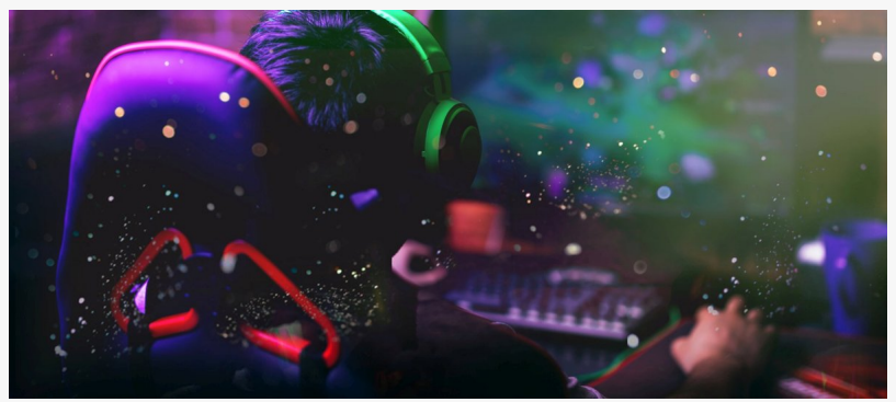
A Job Doing What You Love