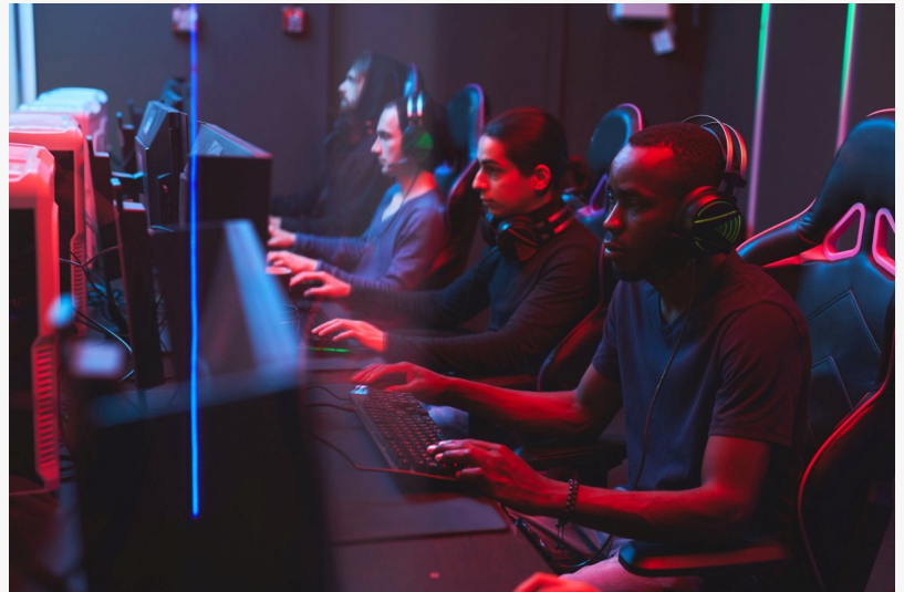
Test Video Games as Part of a Team

This press release can be viewed online at: https://www.einpresswire.com/article/545049434