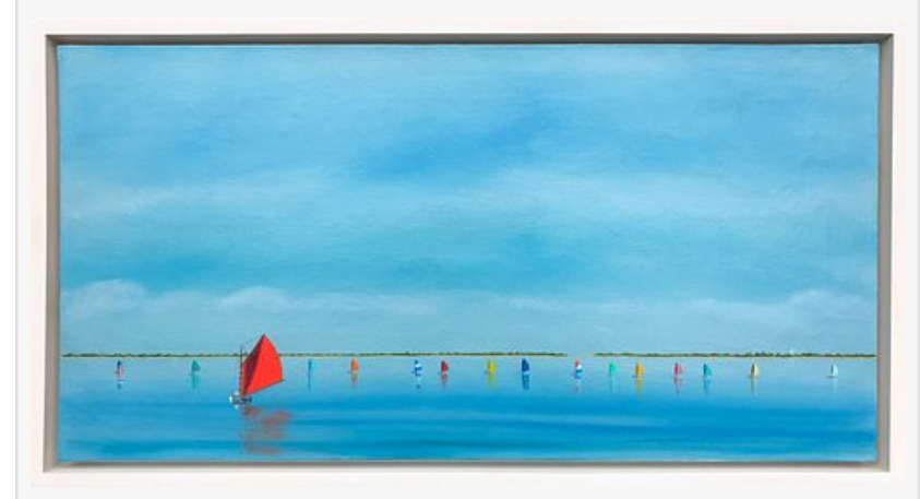
Lot 117 - Rainbow Fleet Sailing in Nantucket Harbor

goldsmith Diana Kim England is a work of art and a definite choice for that special Nantucket lady, $1,500/2,000.