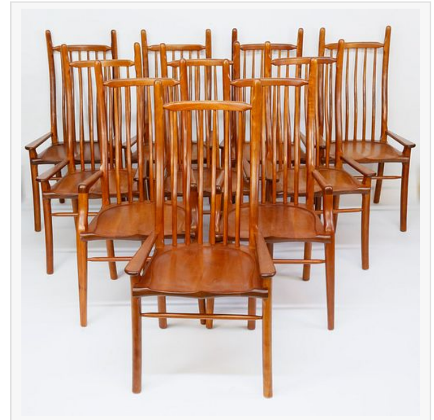
Lot 140A - Set of 10 Stephen Swift Cherry High Back Dining Chairs

Selections of Estate jewelry include two Bvlgari diamond male bracelets in Steel and 18 Quiros Yellow Gold, each stimulated $ 3,000 / 4,000. Vintage Ilias Lalaounis 18K Gold Hercules Knot Dear Bracelet to bring $ 800 / 1,200; A trio of Hermes Enamel estimated $ 500/750; A Tiffany & Co. 18k Yellow Gold Sea Urchin Pin, circa 1960s is expected to bring $1,250/1,750, plus a Cartier 18k Yellow Gold Leopard Ring with Emerald Eyes $600/800. A 14k Gold Nantucket Basket Pendant-necklace with scrimshawed blue hydrangea by island