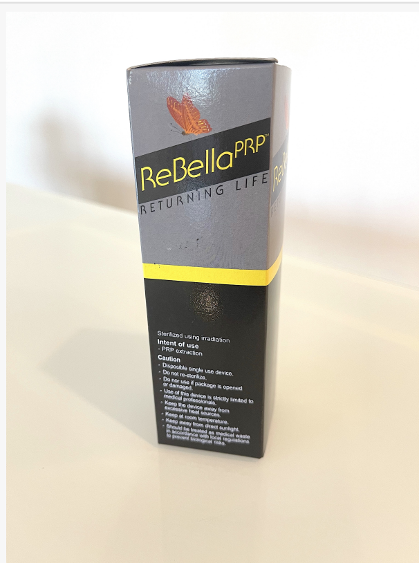
ReBella PRP kits come in 30ml or 60ml