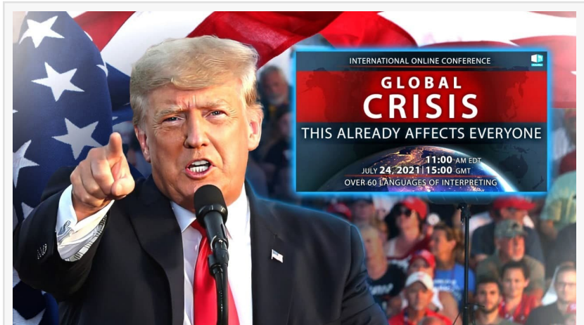
Americans Call for President Trump to be Voice of Humanity at Global AllatRa Conference

would like to start by thanking you for all your accomplishments during your presidential term. You have shown the most humanness, kindness, and compassion towards all people.