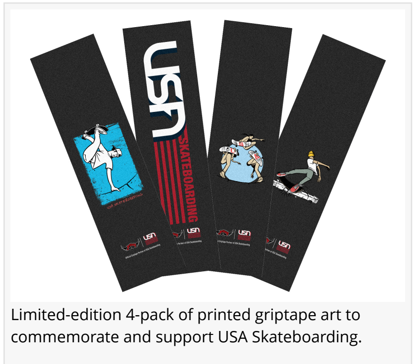
Limited-edition 4-pack of printed griptape art to commemorate and support USA Skateboarding.

Jessup currently sponsors a global team of nearly 100 individual competitive skaters. “We’ve