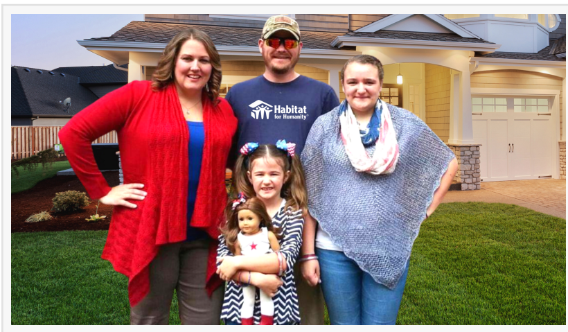
Habitat for Humanity is a nonprofit organization that helps people in your community and around the world build or improve a place they can call home.

MIAMI AND SHELBY COUNTY, OHIO, USA, July 1, 2021 /EINPresswire.com/ -- It's no secret that low-interest mortgage rates, coupled with low inventory have created a perfect storm that has steadily pushed U.S. home prices higher and higher through 2020, 2021, and potentially into 2022/3.