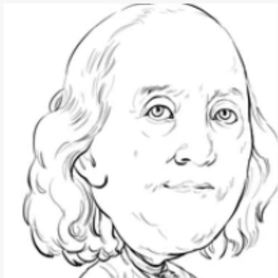
Scott J Cooper Water Shortage

This press release can be viewed online at: https://www.einpresswire.com/article/545178291