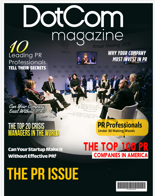
The DotCom Magazine Entrepreneur Spotlight Show