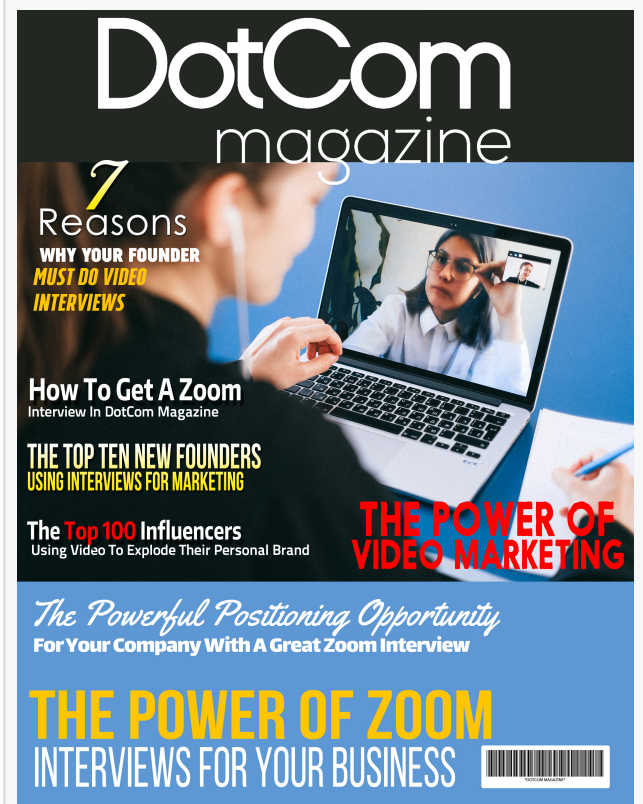
The DotCom Magazine Exclusive Zoom Interview