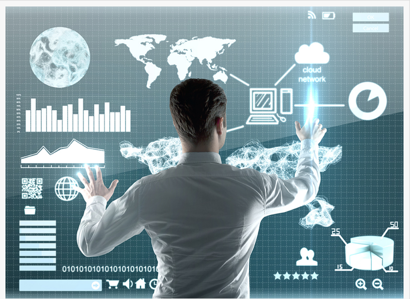
Magnesium: light, strong, durable, versatile, green

000000000000: https://www.whitehouse.gov/briefing-room/presidential-actions/2021/02/24/executive-order-on-americas-supply-chains/ 000000000000000000000000: https://www.whitehouse.gov/wp-content/uploads/2021/06/100-day-supply-chain-review-report.pdf 000000000000 https://www.reuters.com/business/energy/biden-looks-abroad-electric-vehicle-metals-blow-us-