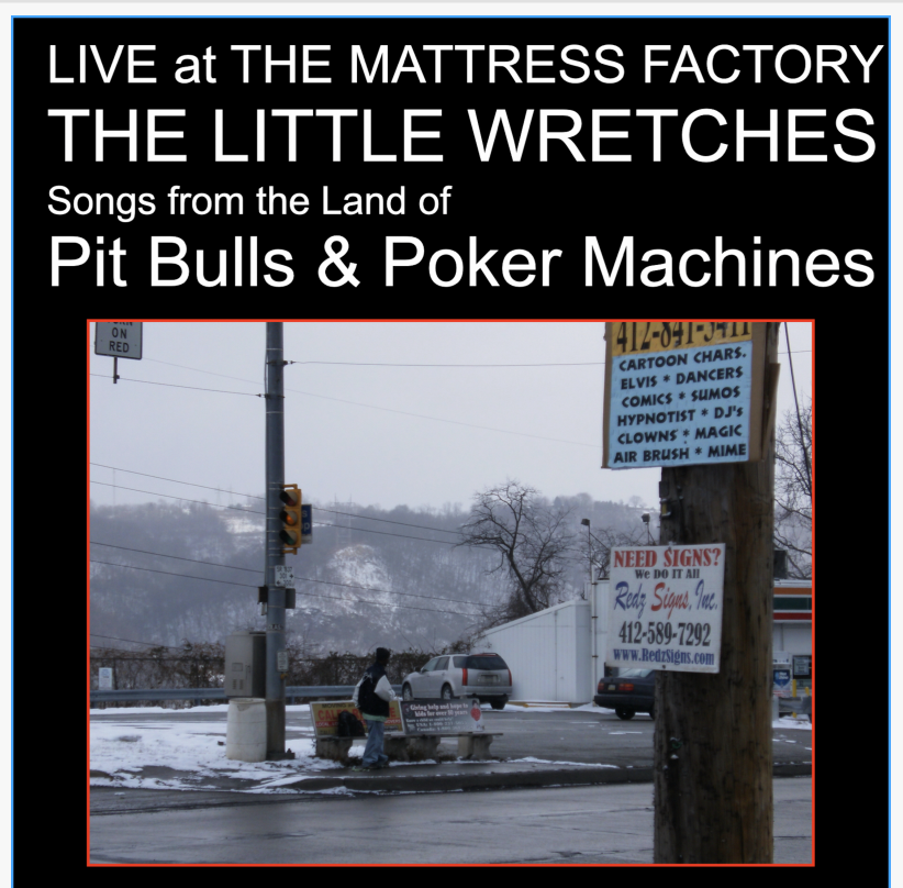
New Live Acoustic Album Out July 1st

The Little Wretches have also just released the official lyric video for "Who Is America" from their "Undesirables & Anarchists" album.