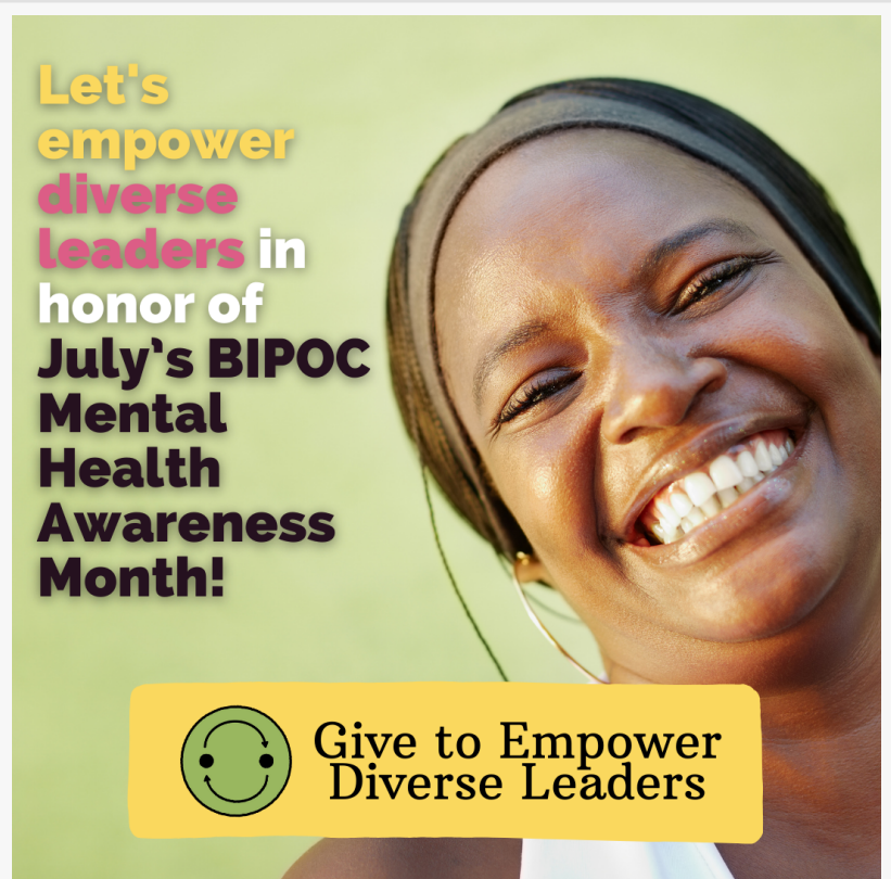
Sidewalk Talk Chapter Leader

Diversity is about our inherent uniqueness. Inclusion is about making everyone feel welcome. Empowerment is contributing to someone's personal and collective power. Sidewalk Talk aims to empower the leadership of individuals whose personal power has not been honored. By raising money to cover the licensing fee to start a Sidewalk Talk chapter, we empower those who want to be a part of this movement of heart-centered listening to improve community health, mental health, and inclusion in their neighborhood.