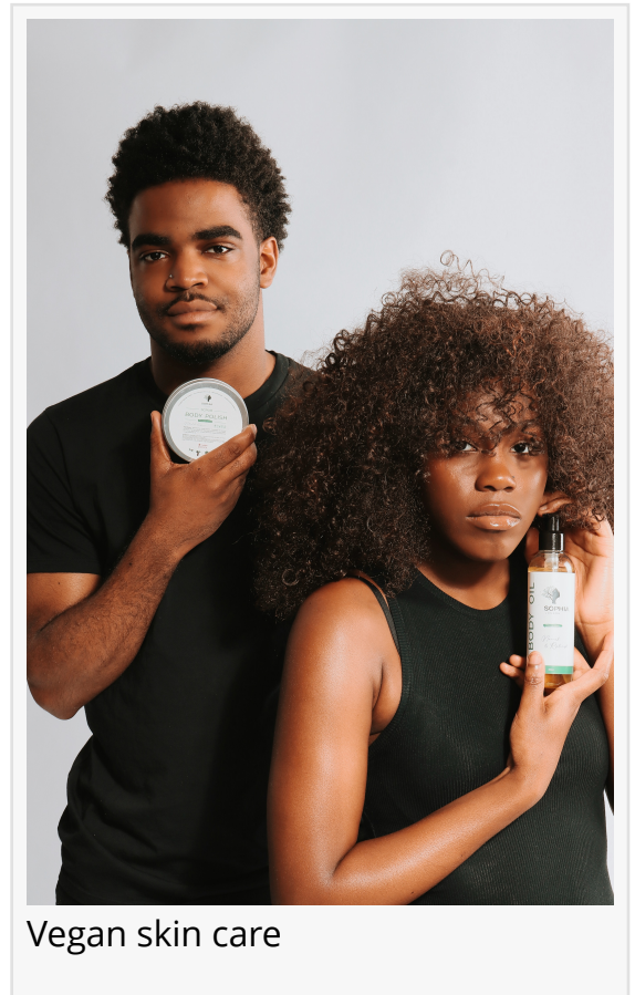
Vegan skin care