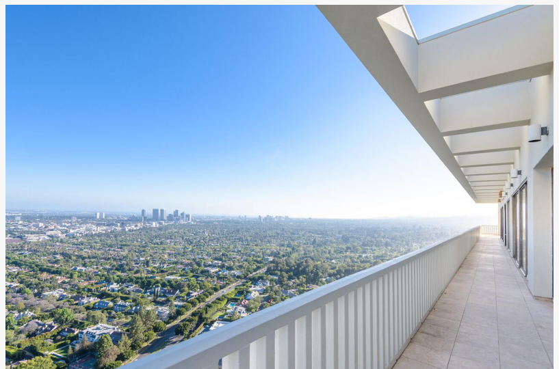
Featuring 4,000 square feet of outdoor living area and 360-degree unobstructed views