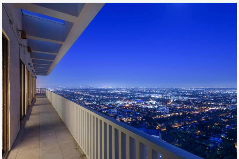
Sierra Towers Penthouse, 9255 Doheny Road #PH1 & 2, West Hollywood, CA