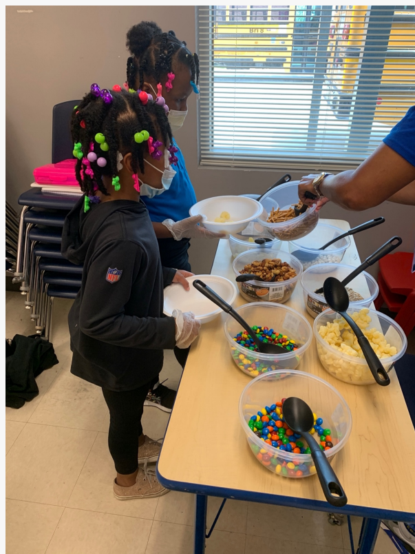
Big Buddy Children choose healthy ingredients in trail mix.