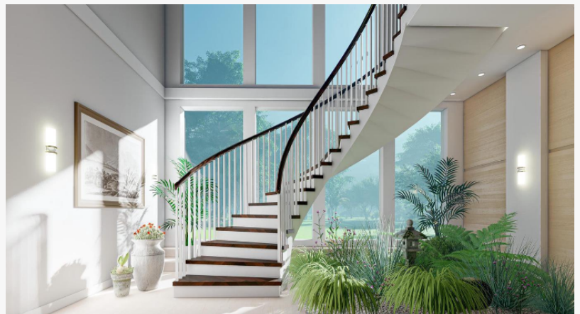
Circular Stair Indoor Garden