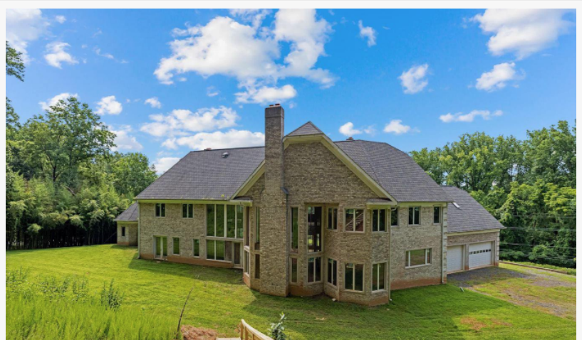
Bethesda Home for Sale

It also boasts a big gourmet kitchen, spacious living room, dining room and sitting rooms, as well as a first-floor gym and recreation room.