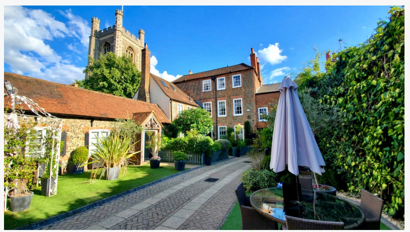
In the heart of Hart street - Longlands House perfect lockup and go property

It is certain that no expense has been spared in renovating this period property; its beauty, charm and location make Longlands House one of the best homes in the UK.