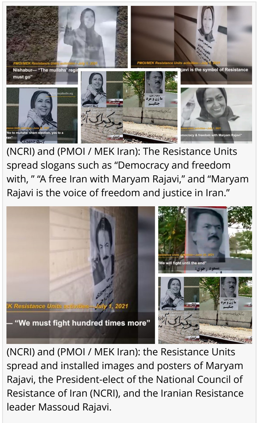
(NCRI) and (PMOI / MEK Iran): The Resistance Units spread slogans such as “Democracy and freedom with, ” “A free Iran with Maryam Rajavi,” and “Maryam Rajavi is the voice of freedom and justice in Iran.”

Shahin Gobadi NCRI +33 6 50 11 98 48 email us here