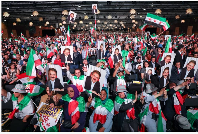
Free Iran World Summit 2021.

well as on the general situation of human rights in Iran and emboldened Iran to continue to