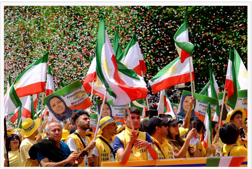
The Iranian supporters of The National Council of Resistance of Iran (NCRI), and the People's Mujahedin of Iran (PMOI / MEK Iran). in a Free Iran rally.