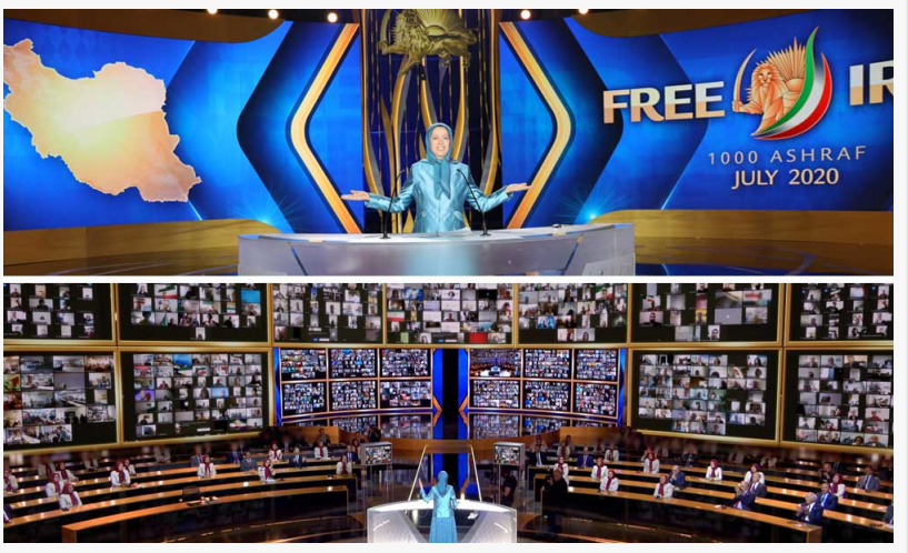
Ashraf-3, Albania, July 17, 2020 – Maryam Rajavi, the President-elect of the National Council of Resistance of Iran (NCRI), speaking during the Free Iran Global Summit: Iran Rising Up for Freedom. Iranians, 1000 current, former government officials,...

Their testimony will assuredly be accompanied by recommendations for how the international community can