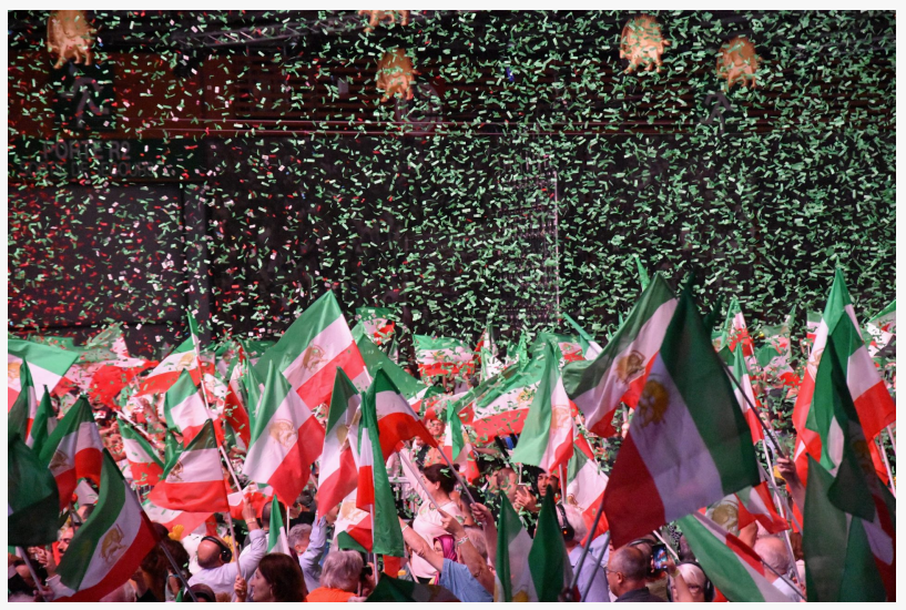
(PMOI / MEK Iran) and (NCRI): Thousands of Iranians around the world will gather during the event.

(PMOI / MEK Iran) and (NCRI): Supporters of Iranian resistance worldwide prepare for "The Free Iran Global Summit," and people across Iran show their support for this annual gathering.