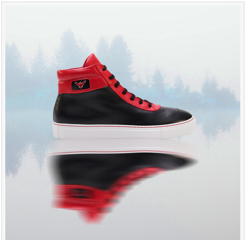
Czar Clothing - Custom handmade shoes

He said the Czar Clothing line is intended for cultured, educated, confident, non-conformists and empathetic and admirable leaders to build their own empire. “Czar and czarina culture promotes the finer things in life, including language, culture, arts and a healthy lifestyle. Whether you reside in the United States, Russia, another European country or any