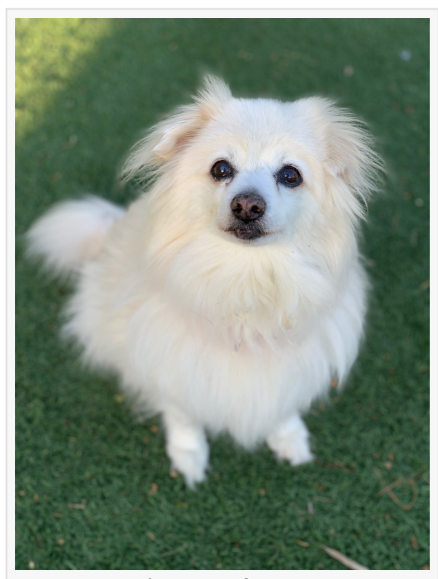
By covering the cost of veterinary care, Grey Muzzle enables senior dogs like Roxy, who might otherwise not be adopted, to spend the rest of their lives in forever homes.

Thanks to the support of The Grey Muzzle Organization, the Norfolk (Virginia) SPCA will provide 60 homeless senior dogs like Cleveland with dental