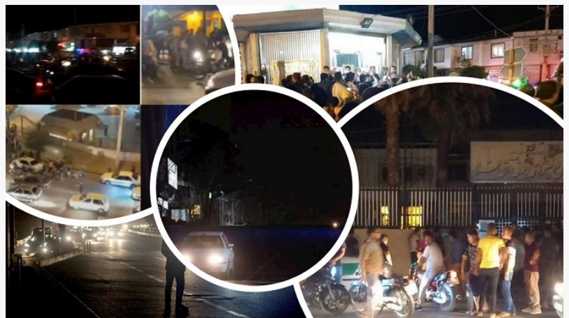
(PMOI / MEK Iran) and (NCRI): Power blackouts trigger protests in many cities.

Kazerun, Kordkuy, Gonbad Kavus, Hamedan, Pakdasht, Aq Qala, and Bushehr took to the streets chanting "death to Khamenei and death to the dictator."