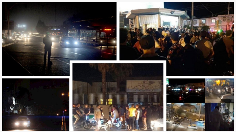
(PMOI / MEK Iran) and (NCRI): Power outages protests expose the regime's fading power.

in Shiraz and Gohardasht, the people chanted, "Death to Khamenei and death to the dictator," protesting power outages. In Ahvaz, the protesters entered the city's Power Department. In Pakdasht, protesters blocked the streets and set fire to garbage cans and tires to protest the power outage. Protesters closed the roads in Fashafuyeh