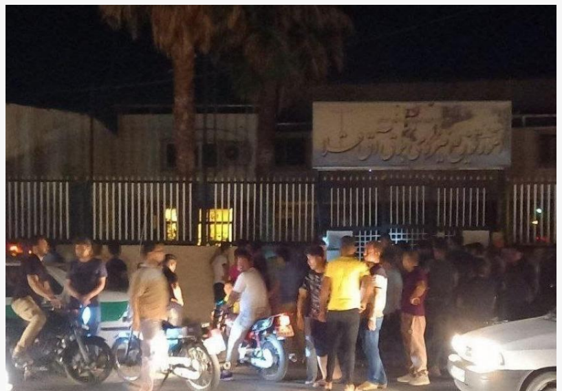
(PMOI / MEK Iran) and (NCRI): Plastic industry workers in Kahrizak protested against repeated power outages and gathered inside the district power department.

Meanwhile, the country's wealth and resources are being plundered by the regime's leaders or