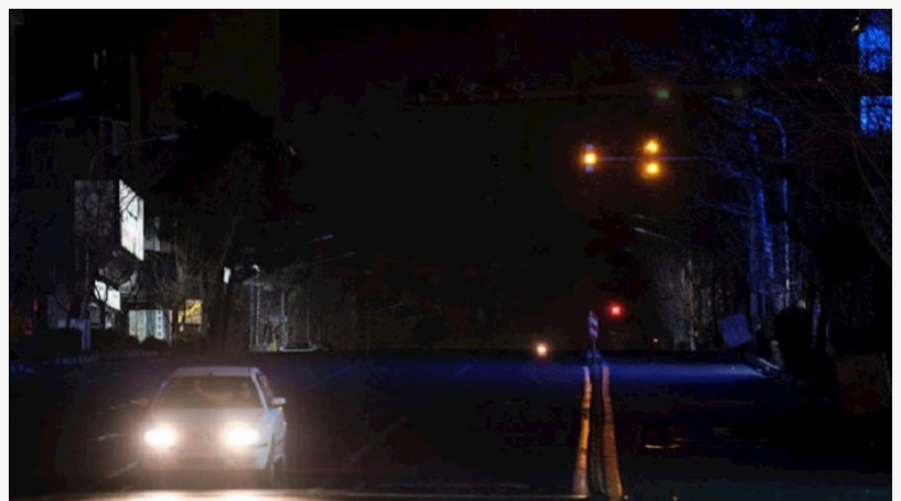
(PMOI / MEK Iran) and (NCRI): In some cities, people gathered in front of the governor's office or the power department.