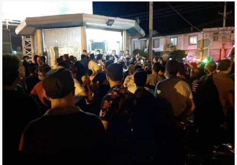
(PMOI / MEK Iran) and (NCRI): Power outages across the country, ongoing for a long time, have become more widespread in the past few days.