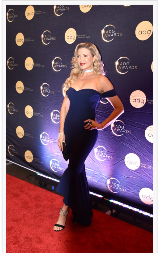
Australian Director's Guild Awards

This press release can be viewed online at: https://www.einpresswire.com/article/545666735