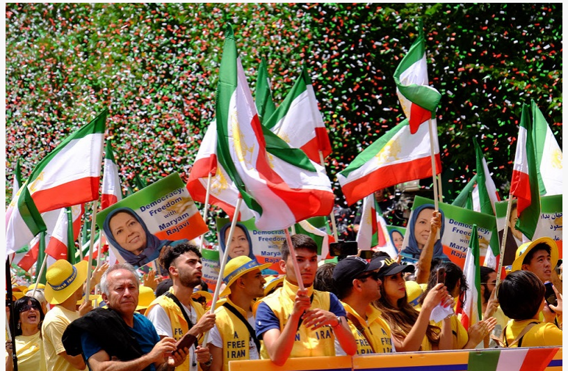
The Iranian supporters of The National Council of Resistance of Iran (NCRI), and the People's Mujahedin of Iran (PMOI / MEK Iran). in a Free Iran rally.

/EINPresswire.com/ -- On Saturday, the Organizers of the Free Iran World Summit 2021 will begin hosting its annual international gathering. Past such events have featured a wide range of Iranian expatriate activists, as well as American and European lawmakers and foreign policy experts representing diverse political affiliations.