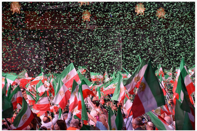
Free Iran Grand Gathering in Paris.

Signs of a pending uprising began to emerge the very day after the June 18 election, with workers in the petrochemical industry going on strike and staging protests which made it clear that they put no faith in President-elect Ebrahim Raisi's promises of reduced corruption and economic revitalization. Additional protests have since erupted across different sectors of the economy and among the civilian population in general, and growing numbers of them are adopting the slogan "down with the Khamenei" to make it clear that they see regime change as the only solution to any of the country's major problems.