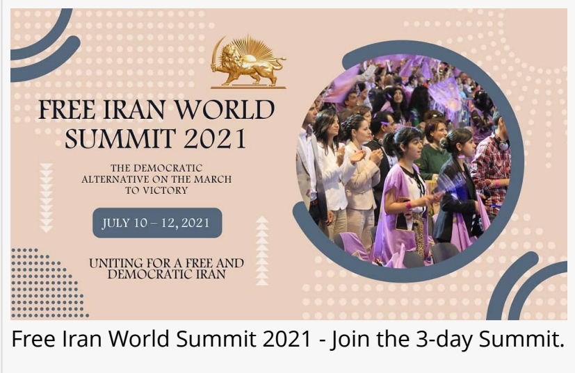
Free Iran World Summit 2021 - Join the 3-day Summit.