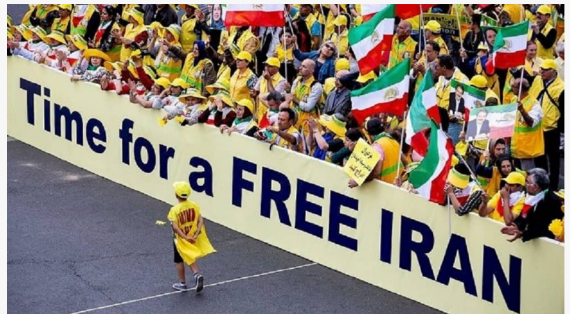
Free Iran gathering in Berlin 2018.

(PMOI / MEK Iran) and (NCRI): Supporters of Iranian resistance worldwide prepare for “The Free Iran Global Summit,” and people across Iran show their support for this annual gathering.