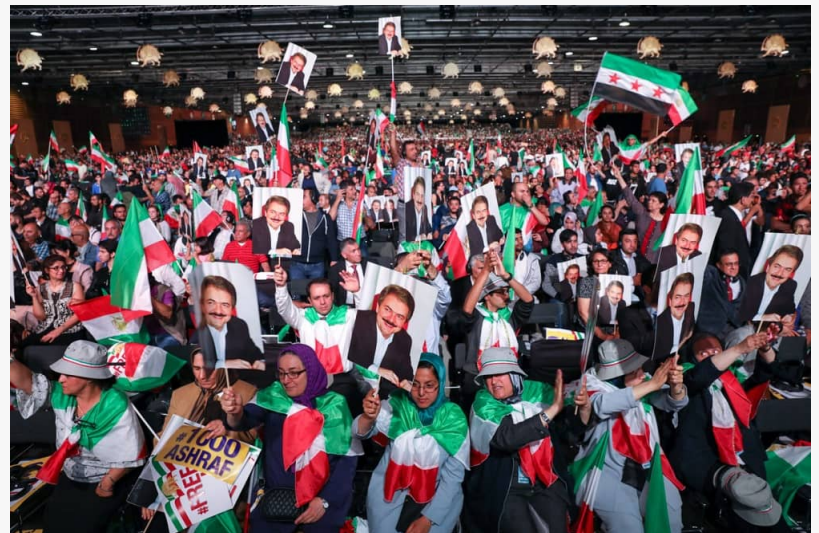
Free Iran World Summit 2021.