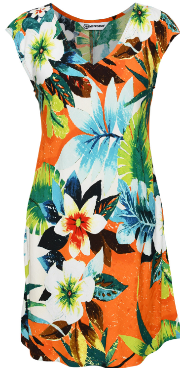
Waiola Orange Sherry Dress