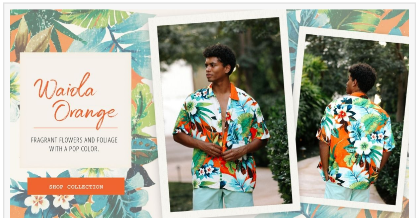
Waiola Orange Collection